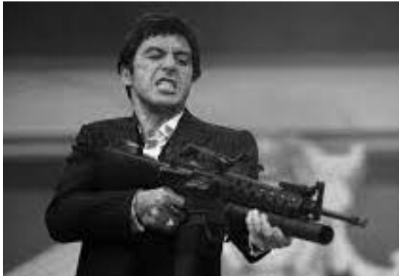
Al Pacino, “Scarface”

McDonagh didn't see his first play—David Mamet's American Buffalo —until he was 14, and then only because his idol, Al Pacino, was the star. His first attempts at writing were bizarre folk tales that he'd show only to his brother. Then he acquired a writer's handbook and began sending his stories off. The BBC rejected 22 of them.