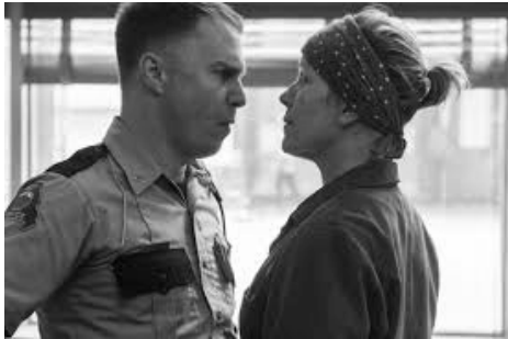
Sam Rockwell & Frances McDormand “Three Billboards Outside Ebbing, Missouri”

was giving up writing plays. (Not true, as it turned out.) This followed hard upon his film debut, the 27-minute Six Shooter (2004), which was his last work set in Ireland. As writer-director, he won the 2006 Academy Award for Best Live Action Short Film, even though he knew little about the filmmaking process. Brendan Gleeson, who starred, said, “He’s such a genius he won an Oscar without having a clue!”