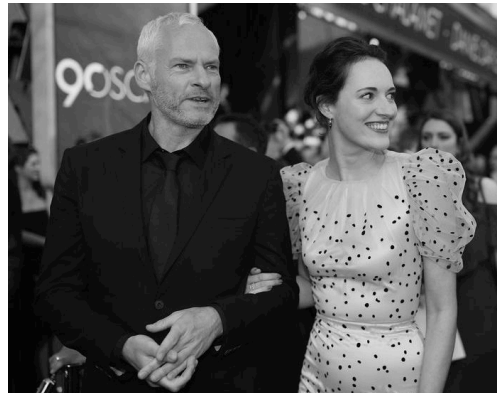
McDonagh & Phoebe Waller-Bridge

“Sadly, it feels like I’m the old establishment now. I’m everybody I set out to destroy when I was younger. I feel like I’ve found some kind of peace with being a playwright these days. It’s okay. I still don’t see many plays that I really like. But that’s all right.”