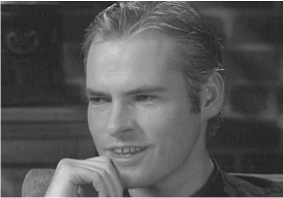
McDonagh in 1998

“Humble? I don’t like humble. If you think you’re good, then it’s a lie to pretend you’re not... To be in this position is strange, because I’m coming to theatre with a disrespect for it... I was reduced to going into theater. Now it’s a leg up to get into films.”