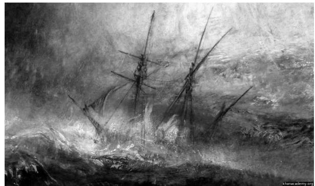
J. M. W. Turner, “Slave Ship” (Detail)

seascapes of J. M. W. Turner, in which he saw intimations of the “howling infinite.” These influences echo through Moby Dick —a book part ripping yarn; part metaphysical contemplation; and part how-to-manual on how to pursue, kill and render the world’s largest toothed mammal into oil for the lamps of civilization. Melville found the novel’s finale in the tale of the whaleship Essex , which in 1820 was rammed and sunk by its supposed prey. (See the book and film, In the Heart of the Sea .)