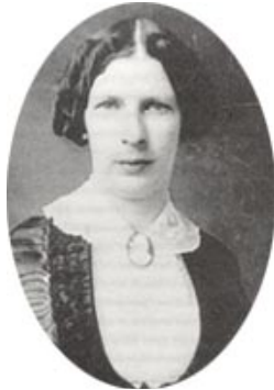
Elizabeth Shaw Melville (1822-1906)

The Melvilles borrowed from Judge Shaw to set up a home in New York City (with Mother Maria). For the first time, the author had access to a large library—and the means to pay for it. (The city’s first free library would not open until 1879.) Virgil’s Aeneid was a particular influence on Melville’s next book, the South Sea romance Mardi . Andrew Delbanco calls it, “a wildly miscellaneous mix of lyrical writing and... a babbling philosopher.” It was not particularly successful, which tightened the financial screws. And while the 1850 publications of Redburn and White Jacket (based on Melville’s voyages before and after his South Sea adventures) did better, a move soon became inevitable.