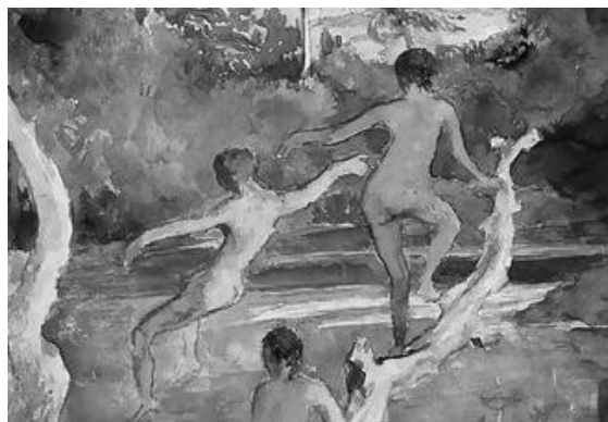
John La Farge, "Polynesian Girls Bathing" (detail)