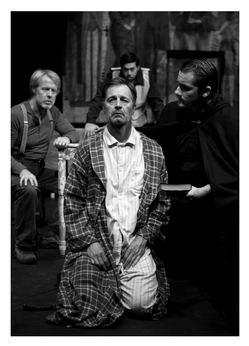
You've done it again—The Night Heron is powerful, compelling, engaging, humorous, and deeply human.